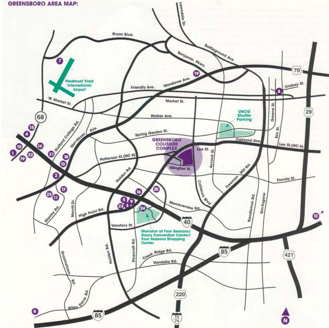
GREENSBORO AREA MAP: